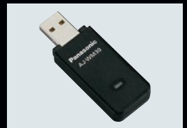
AJ-WM30G Wireless Module