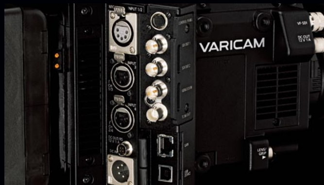
Rear Side Connectors