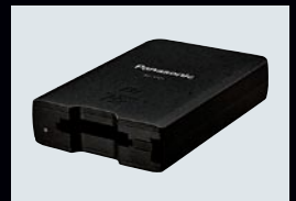
AU-XP01 Memory Card Drive "expressP2 drive"

* Panasonic does not guarantee the compatibility or performance of all EF lenses. For more details, to be updated on the Panasonic website.