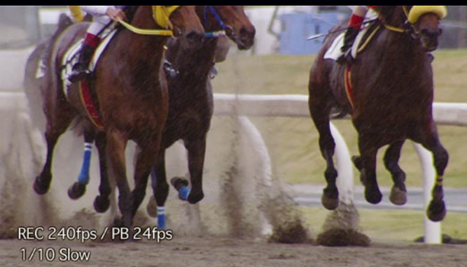
2K/240p Slow Motion