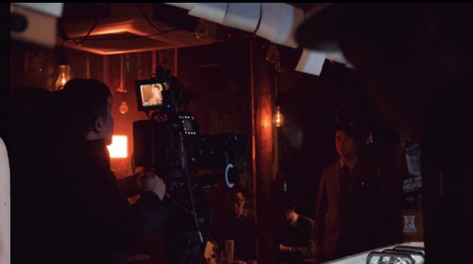
Dual Native ISO of 5000