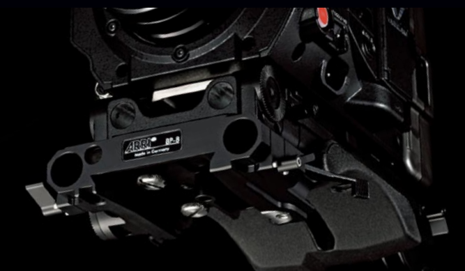
The New Shoulder Mount with a Base Plate.