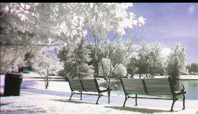
IR Shooting in Daylight