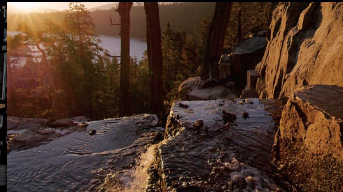
14+ Stop Wide Latitude

* Panasonic does not guarantee the compatibility or performance of all EF lenses. For more details, to be updated on the Panasonic website.