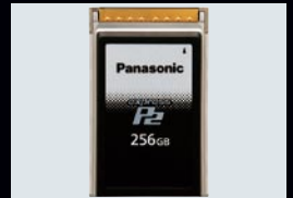
AU-XP0256AG Memory Card "expressP2 card" (256 GB model)