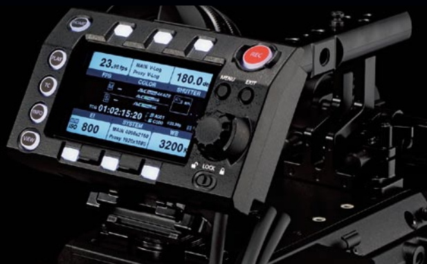
Detachable Control Panel with Monitor