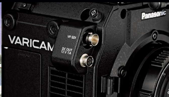
EVF Connections with HD SDI and DC Power