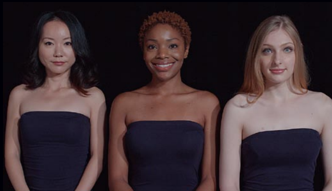
Beautiful Skin Tone