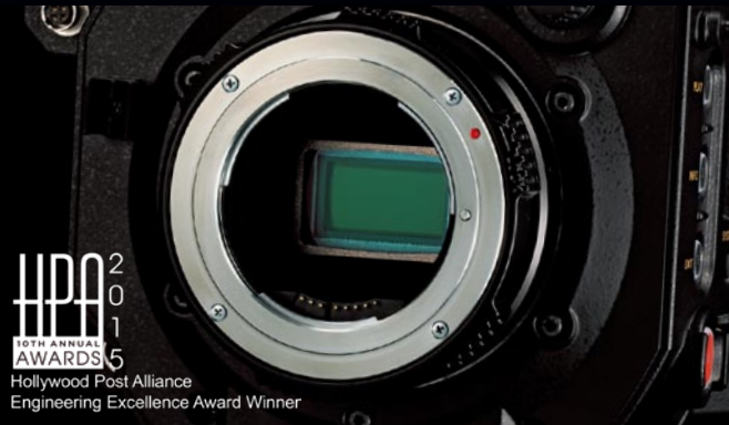
Super 35 mm Imager and EF Lens Mount*

The VariCam LT provides down conversion to Full HD via two 3G HD SDI outputs and one VF output (BNC) while shooting in 4K. Your look with in-camera color grading and information overlay can be applied to each output.